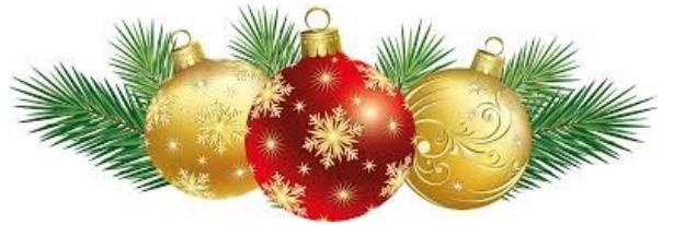
Holiday Party Dec, 11, 2024