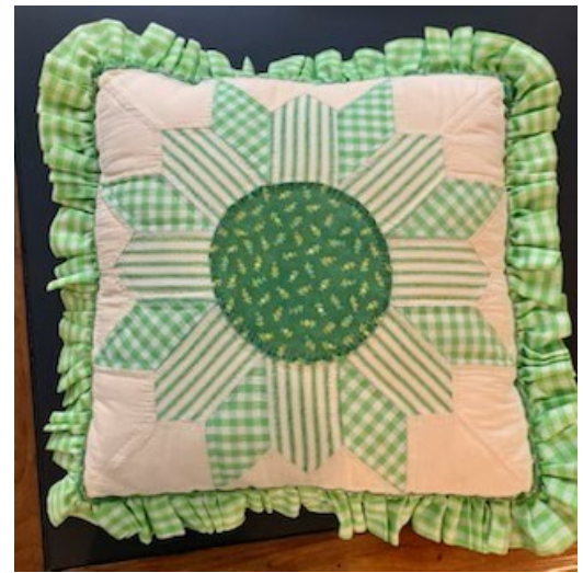
(Above) First projects